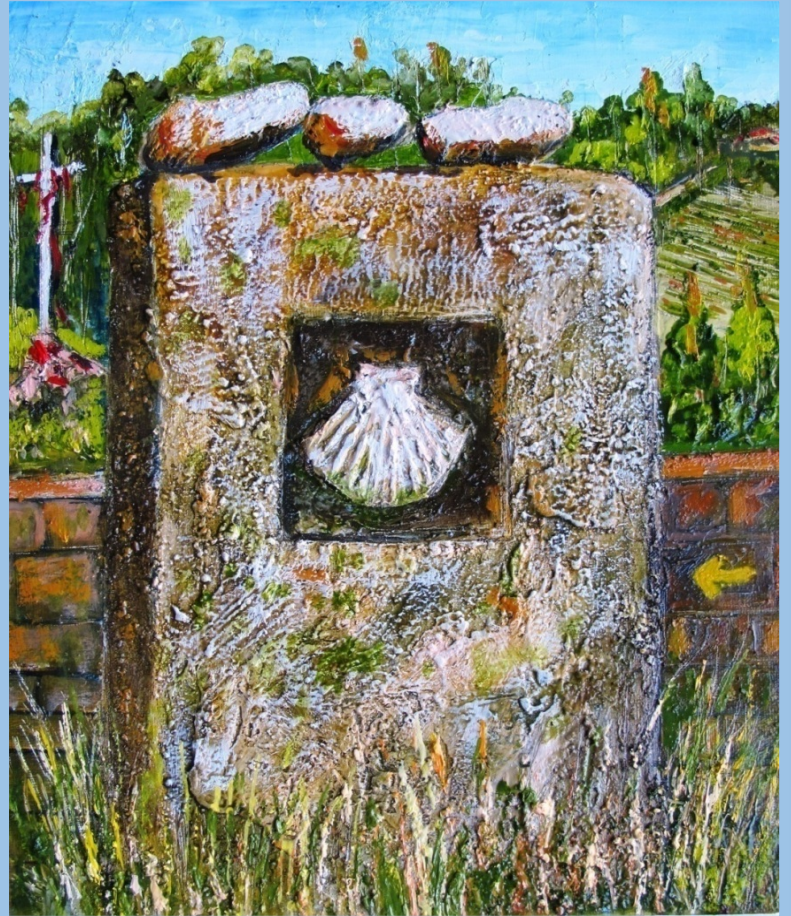
Near the village, a rooster crows in the mist